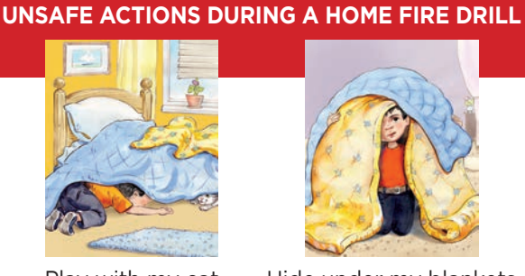
Play with my cat