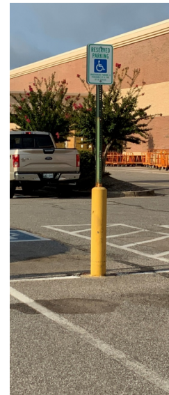
This Reserved Parking Sign does not comply with the new regulations. It has a "u-channel" pole and a yellow painted base. If the base was painted another color, such as black, and a decorative pole was used that matches other sign poles on the property, the sign would comply with the new regulations.