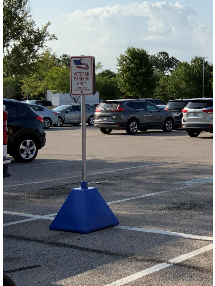
This Reserved Parking Sign does not comply with the new regulations. While it has a decorative silver pole, it has a blue movable base. If this sign was permanently installed in the ground and matches other sign posts on the property, it would comply with the new regulations.

What types of signs do not comply with the new standards? See below for examples of signs with movable bases, "u-channel" posts, and painted based that do not comply with the regulations.