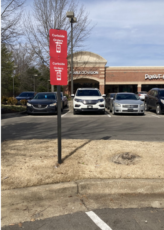
This Reserved Parking Sign at the Collierville Chick-fil-A complies with the new regulations. It has a decorative pole that is dark bronze, permanently installed in the ground, not more than 7 feet tall, and does not exceed 3 square feet of signage.

Are there local examples of Reserved Parking Signs that comply with the new standards? Yes. Chick-fil-A Collierville has a sign with a dark bronze decorative pole that matches other sign poles on the property, is permanently affixed to the ground, is not illuminated, and does not exceed 3 square feet in sign area (see below). Target on Byhalia Road (below) also has Curbside Pickup Signage consistent with the new regulations.